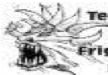
Terrifying and Frightening Beast